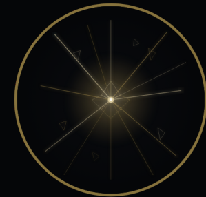
MINERVA / ATLAS / MOSES

Five years old at series start. Draws spaceships. By Season 5, she spends her entire life finding her grandmother across time. Crosses as the apostle Junia. Gives Mara what the pattern never promised: she does not die alone.