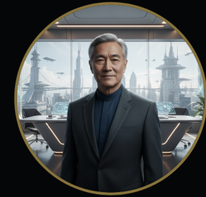
DR. JAMES WEI

Chose faith not despite evidence but because of it. Carries an unopened Vatican protocol envelope. Removes his collar, falls in love with Mara, and rebuilds a theology that doesn't demand science vs. faith.